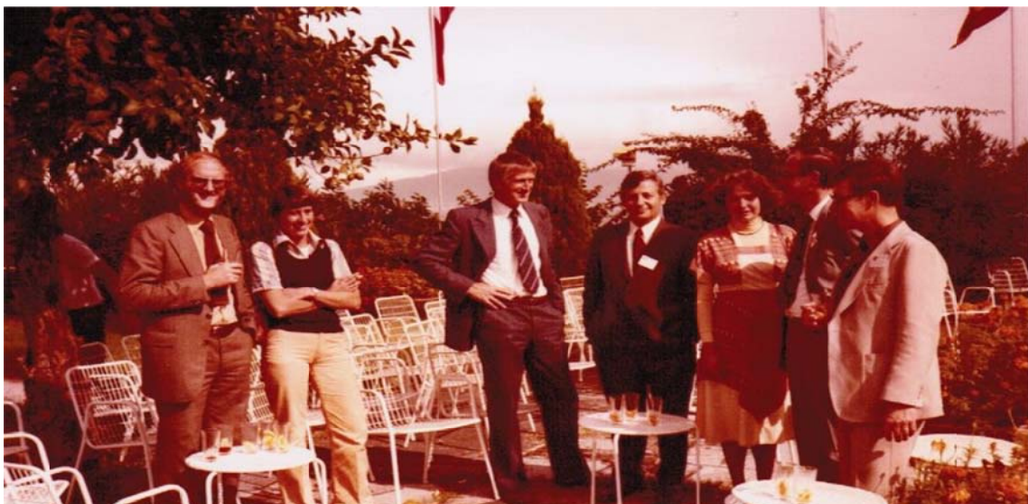
ht: Jan nt), Els

An early DBSS initiative was a spontaneous informal meeting of European key simulationists during the 9 th IMACS World Congress in Sorrento (Italy), September 24-28, 1979. (The Italian key people of this IMACS congress were Giorgio Savastano and Franco Maceri, who both would later play a relevant role in EUROSIM). In this meeting we discussed the possibilities to establish „common language based” regional European Simulation Societies (united in a federation, in that time provisionally called „European Simulation