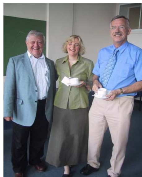
Richard already xcellent Eugene 13 in

SCS Europe continued its annual ESM (European Simulation Multiconference) and ESS (European Simulation Symposium), both under the patronage of the in Sect. 9.6 mentioned ESC (European Simulation Council). From 2005 on, only the yearly ESM was continued, but renamed ECMS (European Conference on Modelling and Simulation) and held under the auspices of the independent “European Council for Modelling and Simulation” (also abbreviated ECMS and successor of the